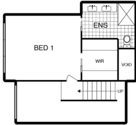
UPPER FLOOR LEVEL