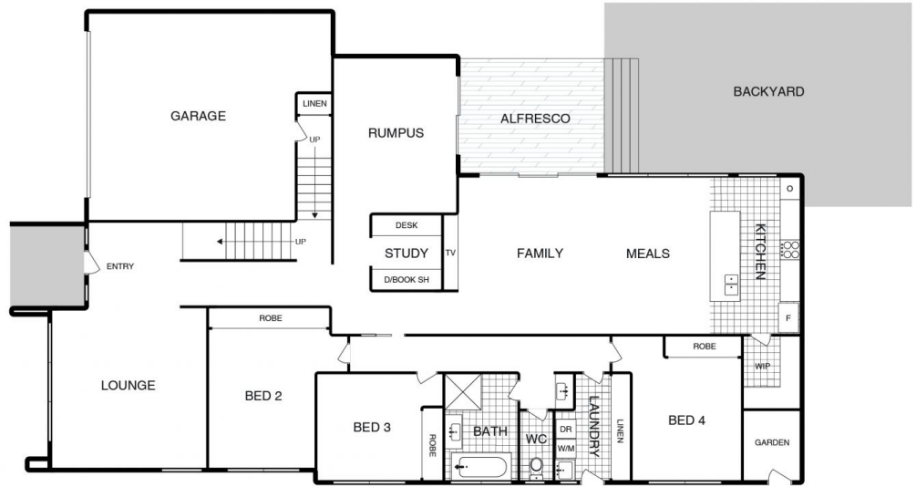
MAIN FLOOR LEVEL