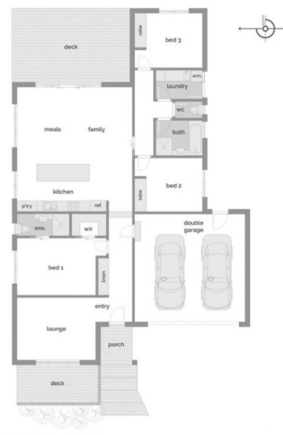
4 Maiya Street, Ngunnawal