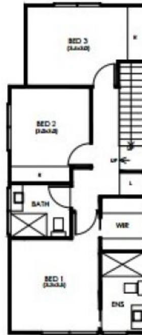
■ FIRST FLOOR PLAN