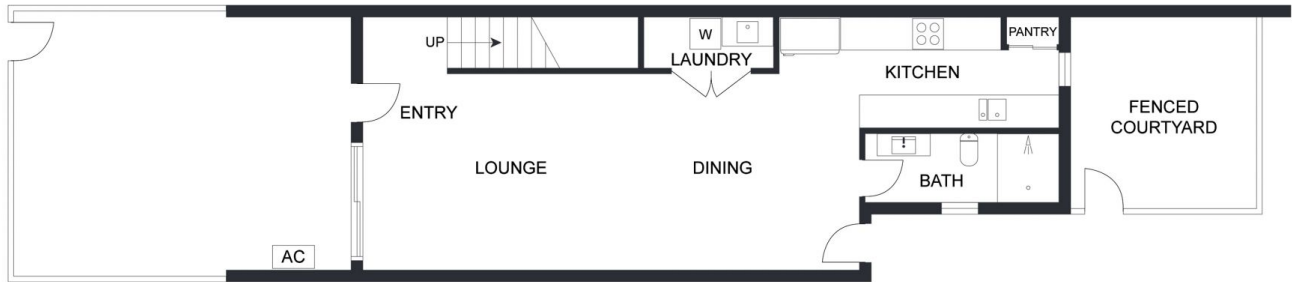
GROUND LEVEL FLOOR